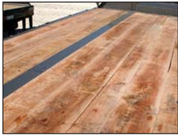
Rough Oak Floor