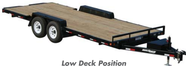
Low Deck Position