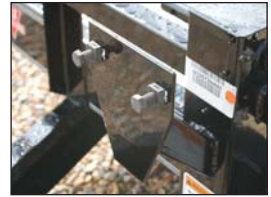
Spare Tire Mount