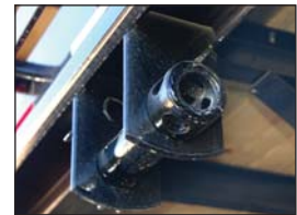
Sliding Strap Ratchets