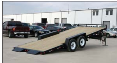
Deck Tilted in Low Position

The patented MultiDeck Tilt by PJ Trailers is one of the most versatile trailers ever built. The trailer can be operated in a low equipment hauler position with a 26" deck height or a high position with a 35" deck height and 102" wide deck. This makes the trailer extremely useful for hauling both narrow or wide track equipment like skid steer and tractors, as well as palletized cargo.