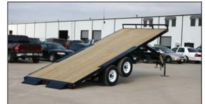
Deck Tilted in High Position