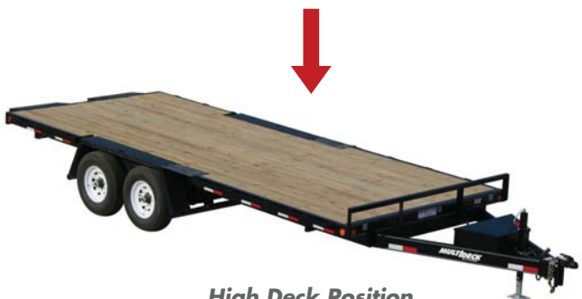
High Deck Position