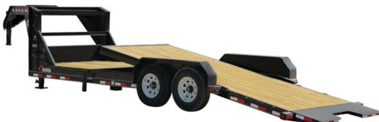
Gooseneck Coupler Available