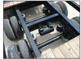
TRAILER FLEX TrailerFlex Air Ride Suspension