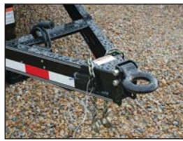
3" Pintle Eye