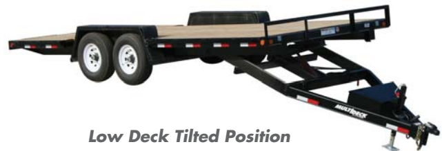
Low Deck Tilted Position