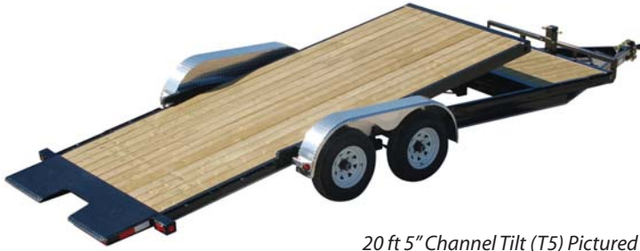
20 ft 5" Channel Tilt (T5) Pictured (4' Stationary Deck + 16' Tilt)