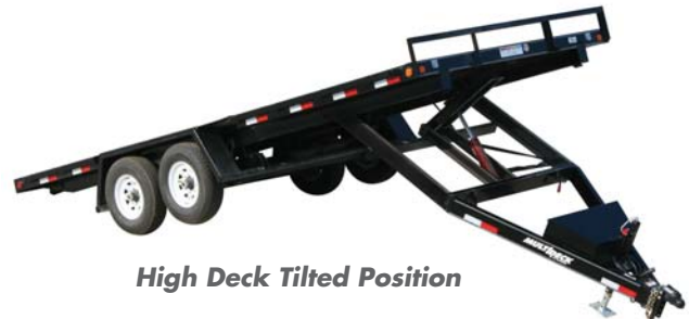
High Deck Tilted Position