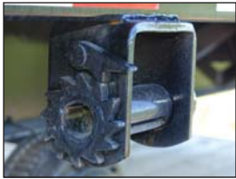
Weld On Strap Ratchets (2)