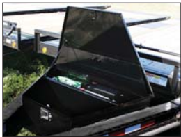
Full Size Divided Toolbox Upgrade (T8 & T9)