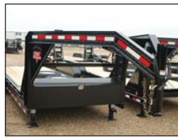
8" I-Beam Gooseneck